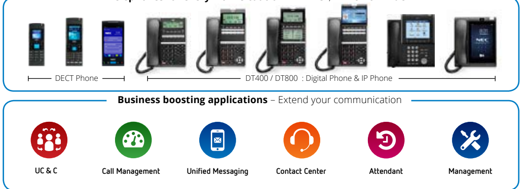
Telephones for every work situation – IP DECT, WiFi & Terminals