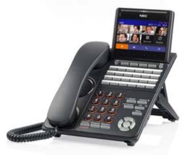
Colour: Easy call control from the office, remote or home-based working, hot-desking