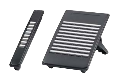
8-line Key Module / 60-line DSS Console